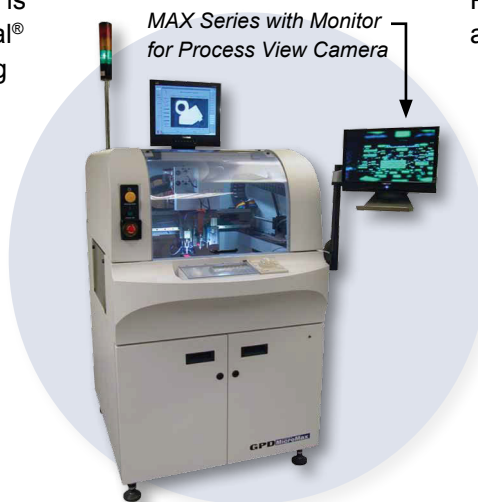
MAX Series with Monitor for Process View Camera

Process View Camera is compatible with all needle dispense processes. It may be retrofitted to existing installed systems. Also, for machines configured with Process View, video capture may also be added separately. Couple this inspection method with our gantry mapping process - Contour Mapping™ - which is performed on all GPD Global® dispensers, and our high-resolution, encoded drive motors, and it is easy to see why GPD Global® is a leader in high precision, high accuracy dispensing systems.